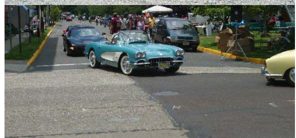
Is that Barry's car behind that Shark?