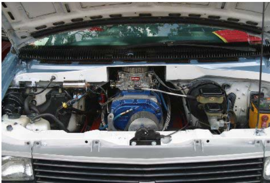
I've never seen a BLOWN Astro Van before!