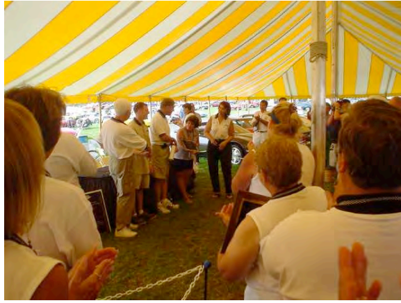
The Delaware Valley Chapter puts on the NCRS Gallery at Corvettes @ Carlisle