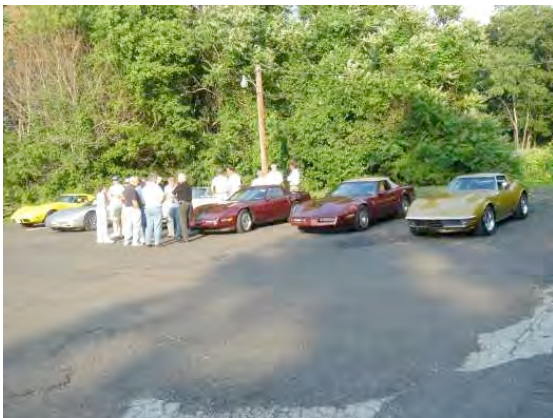
Discussing the cars before a Chapter meeting

The local chapter is the Delaware Valley Chapter (the first chapter formed within NCRS) which meets every other month at the William Bolton American Legion in Fort Washington, PA. Meetings are generally held the third Wednesday of the month starting with the first meeting in February. (The December meeting is a Holiday Party.)