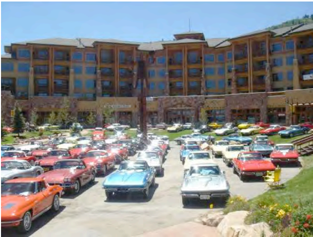
The 2005 National Convention was held at Park City, Utah

And, perhaps the biggest reason to join is to get to know people who are experts in your car and can answer all of those originality and operability questions.