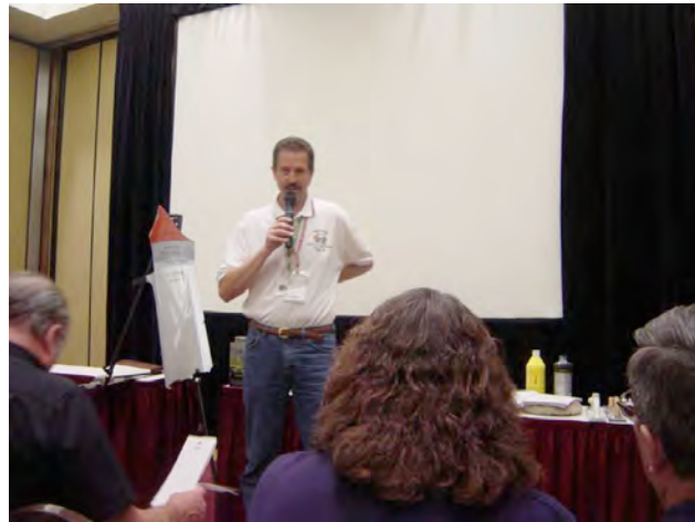
An NCRS Paint Seminar