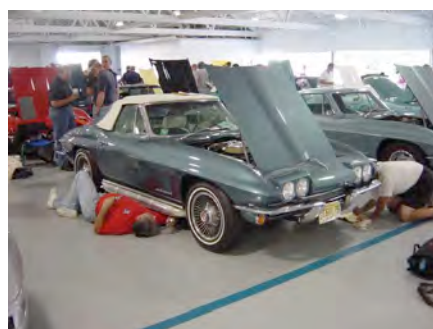
Annual judged show at Bryner Chevrolet