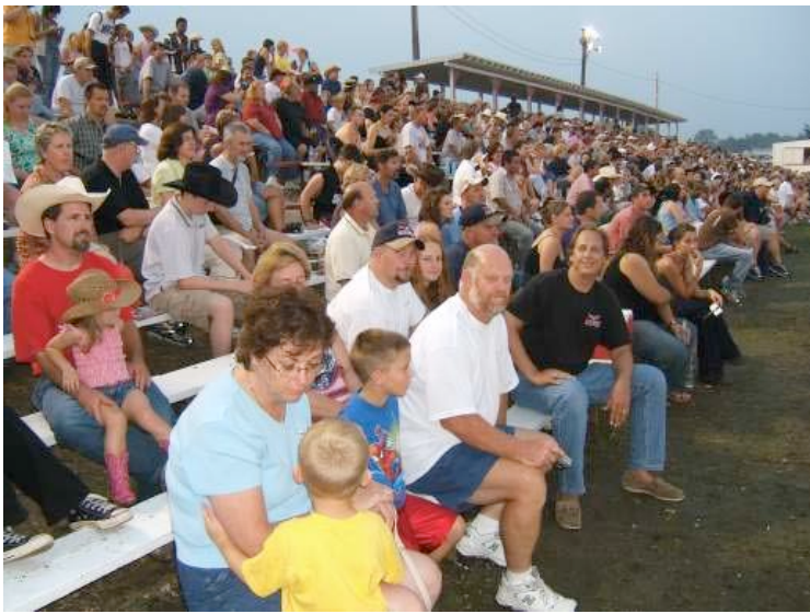
Brahama Bull Riding