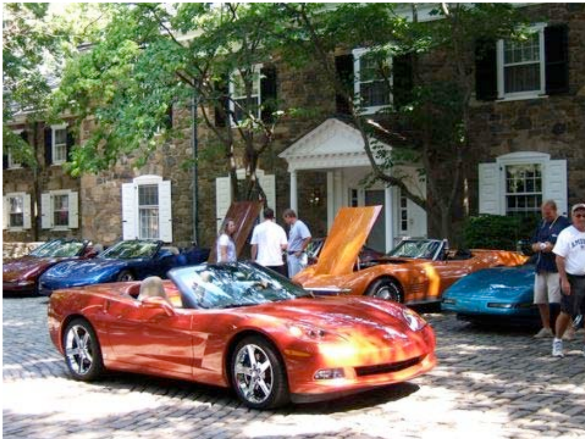
Members cars at the 2006 CCND picnic