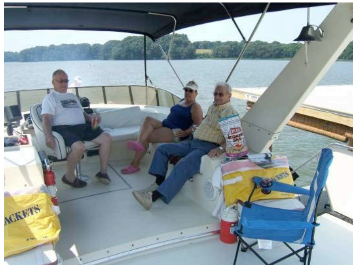
Relaxing on deck