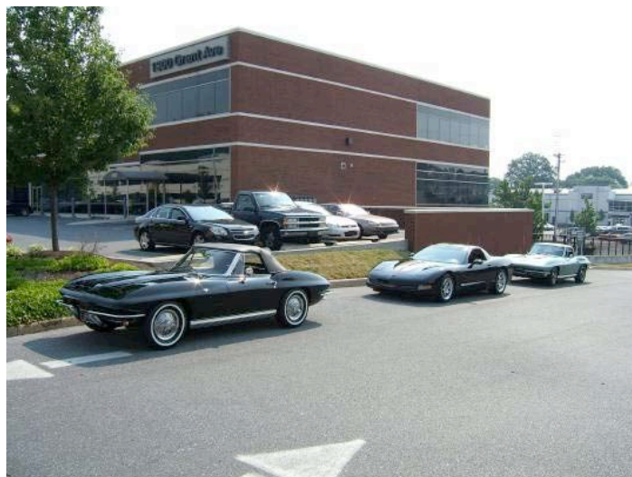
a few CCND cars