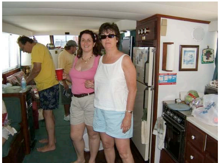
more lunch goes