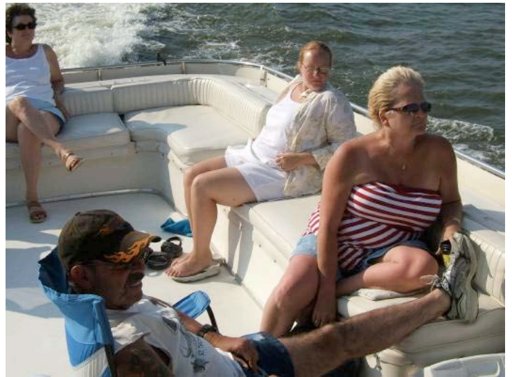
enjoying the breeze while on the move