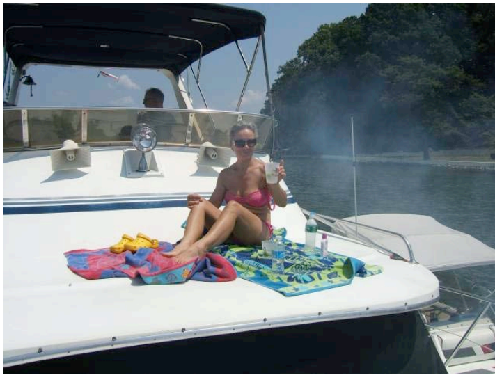
Nothing like sunbathing!