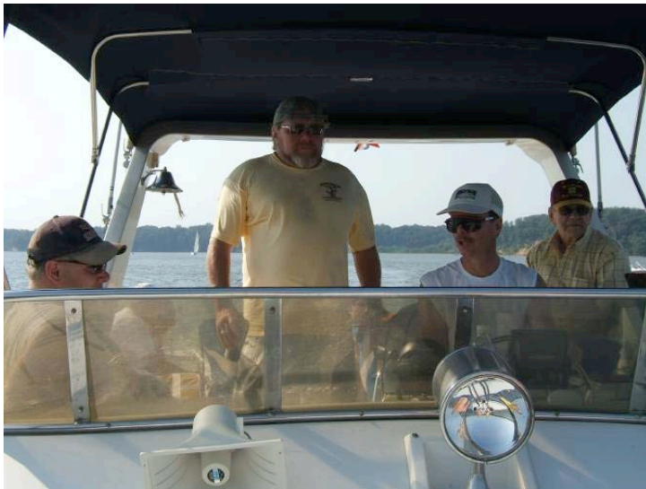
Hanging at the helm