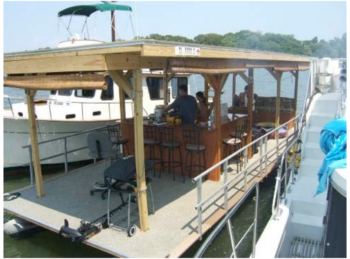
the “Tiki Bar” boat