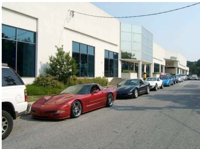
More CCND cars lined up