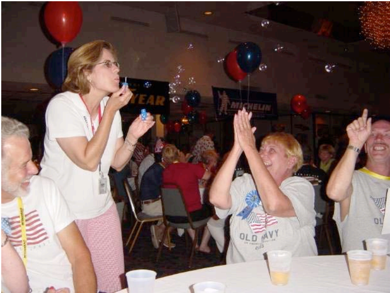
'03 Convention – Partying Again