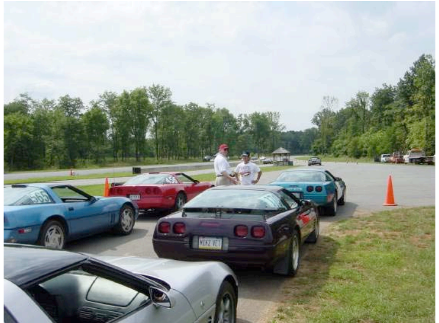
'03 Convention - Autocross at Summit Point – yep, I ran it!

As CCND transitions to a new NCCC governor, I thought it a good time to write about the old days when our club first joined NCCC. As I mentioned in my earlier Member of the Month article, I first joined CCND in 1977. At that time the Club was putting on shows, rallies, tech sessions (meeting at someone's garage to go through how to replace brakes or whatever Corvette-related work needed to be done) and participating in autocrosses sponsored by the local Sports Car Club – Brandywine Motorsports Club. We were doing at least a couple shows a year. I remember putting on a show at Concord Mall where we had 120 cars. This was before the Mall was full of Kiosks and landscaping, and we put 80 cars inside the Mall. The other 40 cars were in front. Judging that many cars was a challenge but the judging was simpler and quicker at that time.