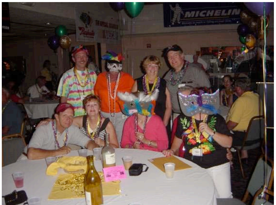
'03 Convention – Mardi Grass party

I think there is a lot of opportunity for CCND members to become involved in NCCC activities and it gives the club an expanded list of offerings for the membership. In the past we have not taken advantage of what NCCC offers, but I hope with our new Governor that we can get more people involved enjoying more Corvette activities like autocrossing and rallying.