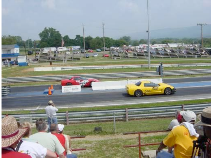
'03 Convention – Corvette Drags

Of course, NCCC offers insurance for all events put on by member clubs. We have had this insurance over the years for our shows and other events. The third party insurance covers any accidents where damage or injury is done to anyone not participating in the event. Thus, our lady who slipped on the Armor All at the Castle Mall would be covered. The insurance also protects the officers (and members) of the club who can be sued if something happens at a club-sponsored event.