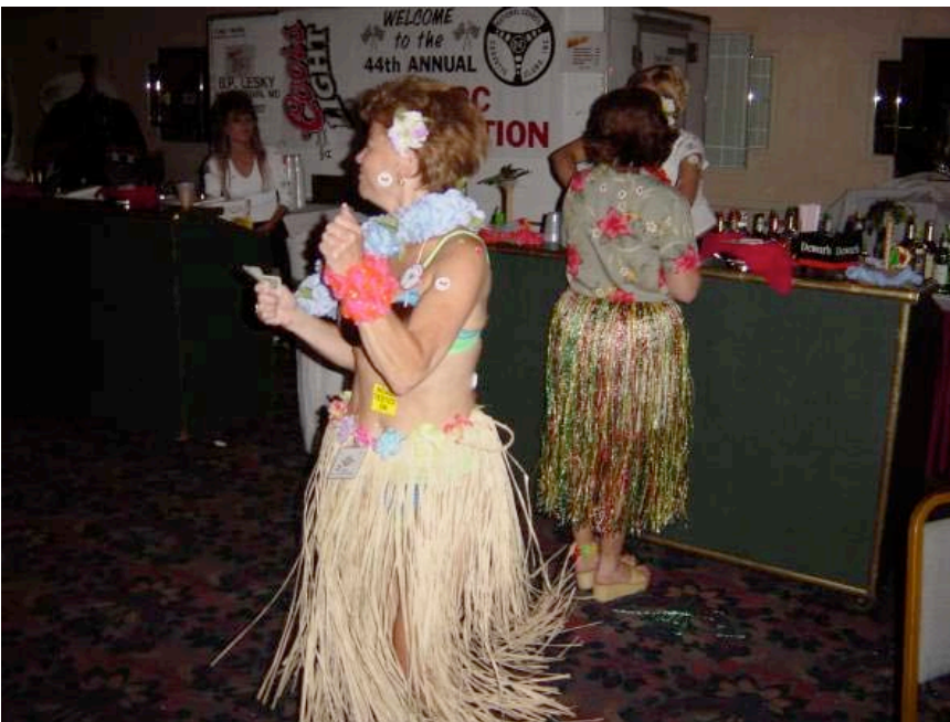
'03 Convention – Hawaiian Party

CCND does have a supplemental insurance policy, but I am not sure what it covers.