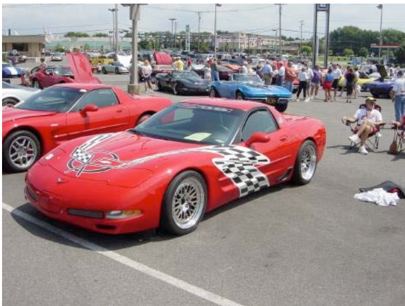
'03 Convention – Concours

We had another show inside the Castle Mall at Route 4 and 72 (long gone now). The day following the show, a lady fell on the tile floor where one of the car owners had used Armor All to shine his tires. She sued but fortunately for us, the Mall had insurance and they agreed to take care of the suit. At about the same time, a