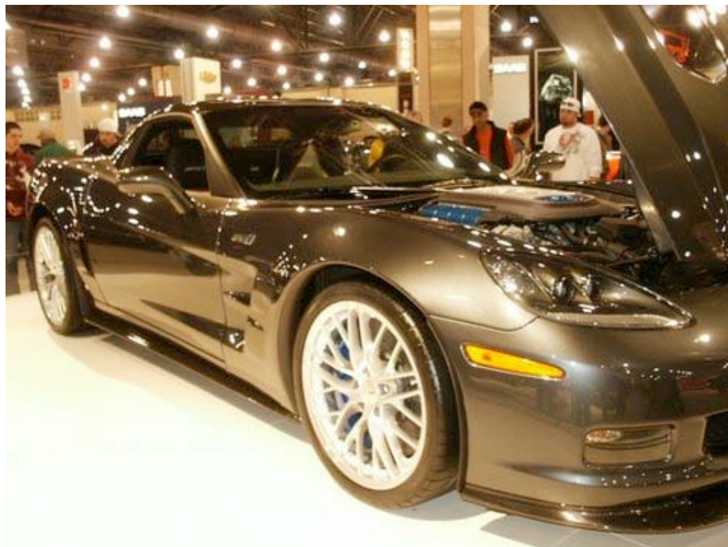
The new 2009 Corvette "ZR1" at the Phila Auto Show