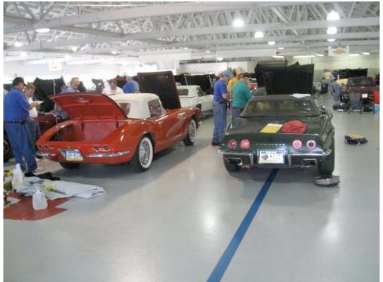
Full classes for C1's & C2's

One fallacy that seems prevalent in the general public is that the engine in the car must be the one delivered in the car for the car to achieve a top flight. That is not correct. NCRS (as does Bloomington) will give full credit to a “restoration engine” as long as the casting number and date and the engine pad (broach marks and stampings) appear as they would have on an engine from the St. Louis plant (commonly referred to as “numbers matching”).