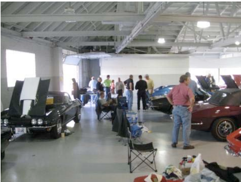
The building filling up

In NCRS judging 2-person teams judge each car in a given class in 5 areas – operations, interior, exterior, chassis, and engine. A team leader is responsible for making sure the teams do their jobs in a timely fashion and that the judging forms get to the tabulation team. The team leader also is the primary contact for each car owner and is responsible for verifying the trim tag on each car. Each team spends about 45 to 60 minutes judging each car – a full day of judging for classes that have the maximum of 7 cars. The judges are judging both originality and condition, based on extensive judging and technical manuals prepared for each year of Corvette by NCRS.