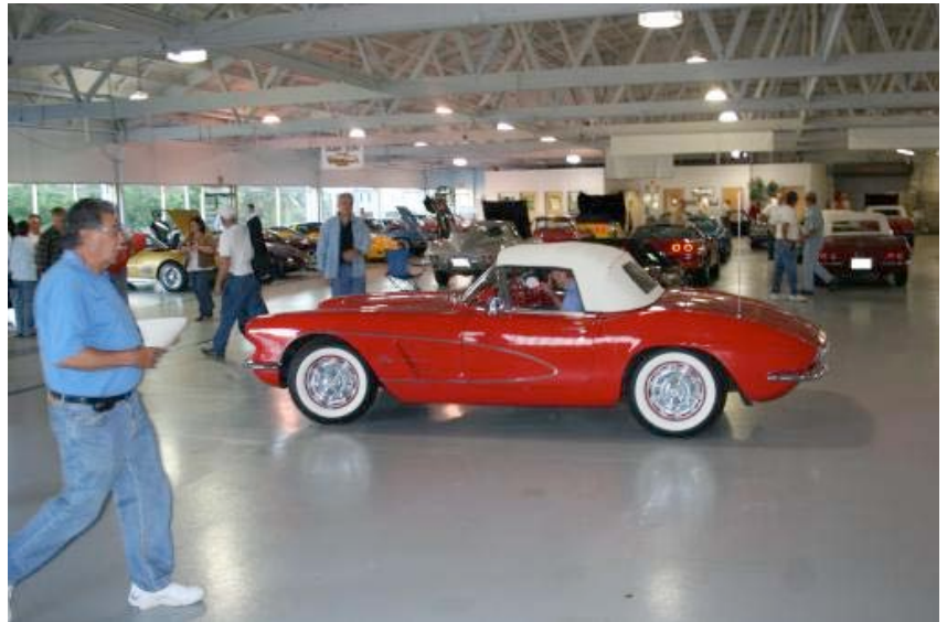
Parking the Entrants cars

NCRS judges Corvettes from 1953 through 1993. The Del Val show had over 40 cars to be judged with full classes for solid axle and mid-year cars. The show draws judges from all over the east coast, many of whom judge at regional meets and at the national convention. In addition to the cars to be judged, there were an additional 30 plus cars in Sportsman (driven Corvettes of all years to be displayed and not judged) and Special Displays (such as previous winners of 5-star awards – totally original – or Duntov awards – cars that have passed performance tests as well as show judging requirements). All cars were displayed inside Bryner's large used car display building.