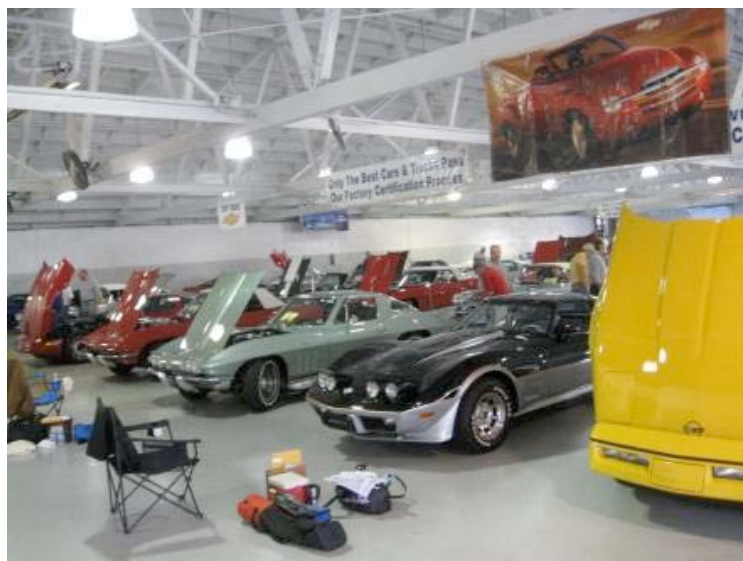
View of Show

I am including several pictures from the show which was a great success. If you are interested in joining NCRS and/or the Delaware Valley Chapter, go to www.NCRS.org and/or www.DelValNCRS.com or call me and I can help. The Chapter meets the third Wednesday every other month in Ft. Washington, PA.