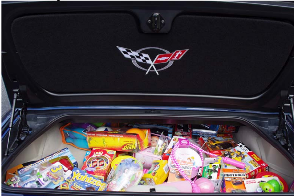
Toys to share with those boys and girls who need to have a smile or two

As experienced in the past, it was a delightful setting; seeing the many toys be carried and stacked on the carts and being readied for the “Treasure Chest” (The Treasure Chest is the special area within the RMH where gifts are stored for the siblings of those kids who are being cared for at Children’s Hospital).