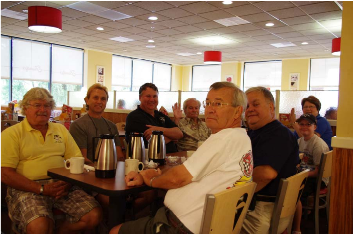
The “NEW” Breakfast Club – A little Less Work but Just as Much Fun

A very sunny and warm day greeted several members of the club when breakfast was served at Friendly's in Lantana Square on our way to the Ronald McDonald House. The breakfast was great and the club gathered for awhile prior to departing to the RMH to enjoy a Christmas in July-Toys for Tots.