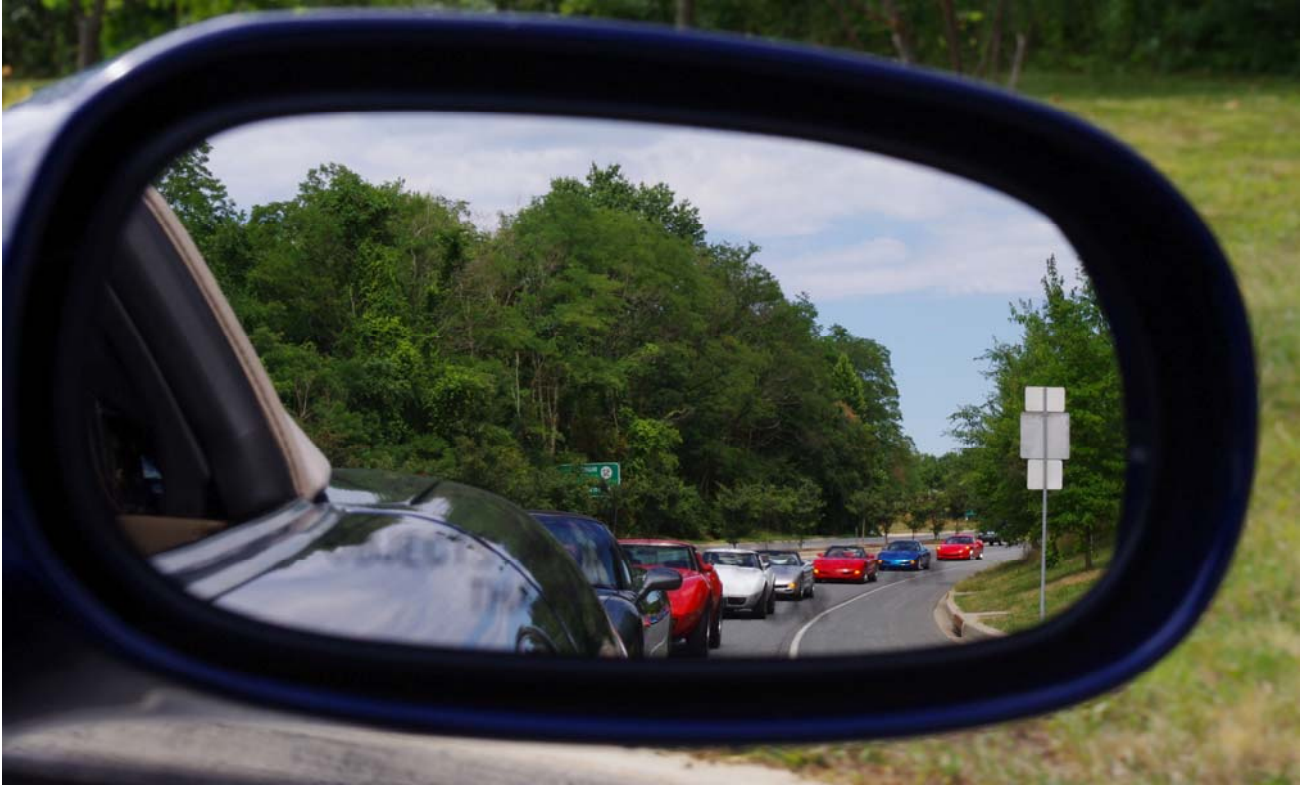
Cruizin' to RMH

I counted about 15 cars and the caravan was a site to see. Several people gave us a right of way, as they watched and smiled as we drove by. We arrived at the RMH right on time and were greeted by the helpful staff.