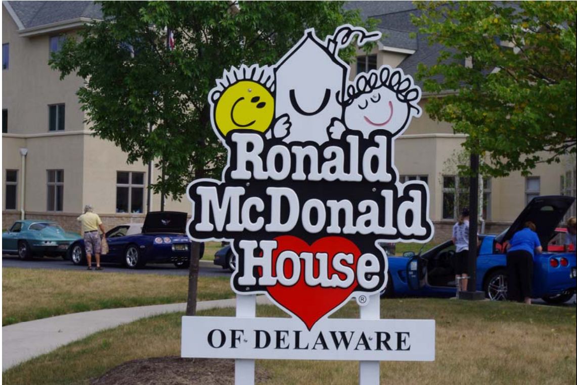
Christmas in July – CCND shows The Spirit of Giving

The official newsletter of the Corvette Club of Northern Delaware - August 2010