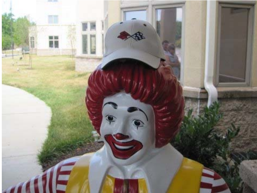
Honorary CCND Member

Many pictures were taken to remind us of yet another special event for CCND. Some members choose to tour the facility as always offered by the staff. The event was short compared to our normal cruises and allowed the members the remainder of the day to enjoy.