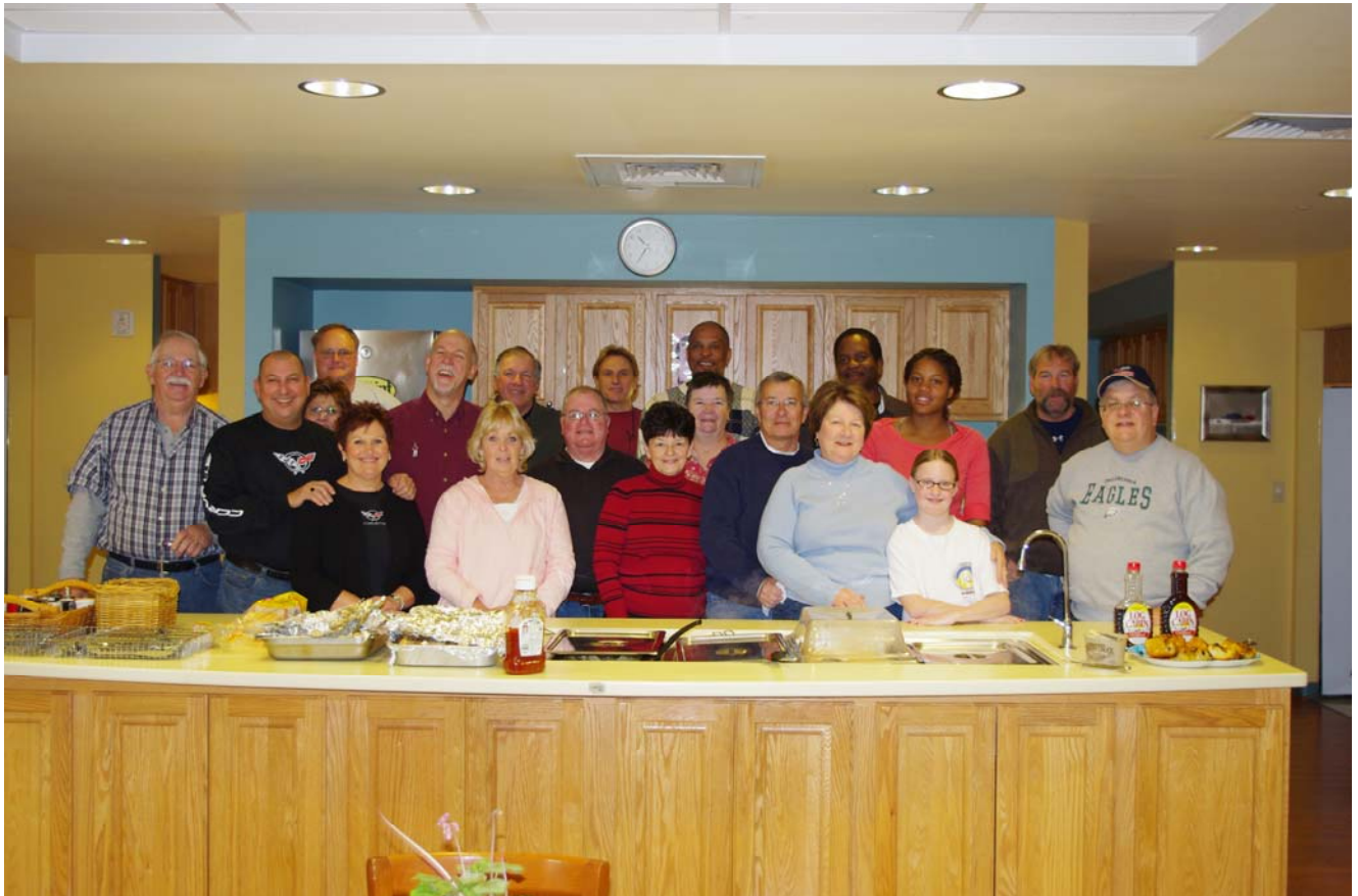
The 2010 “Breakfast Club” - CCND