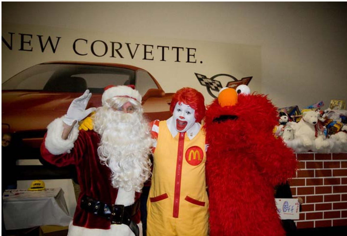
County Corvette Toy Drive for the RMDH of Philadelphia

The official newsletter of the Corvette Club of Northern Delaware - January 2010