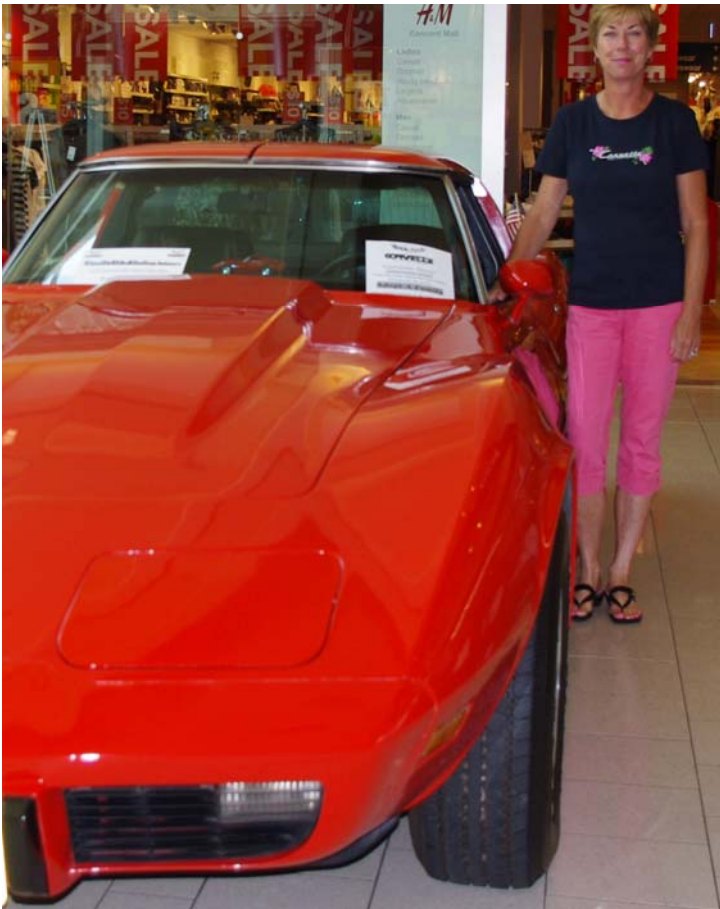
Some Smiles are just plain better than others!!