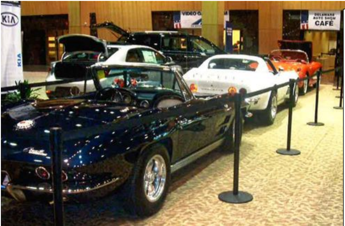
Delaware Auto Show

The official newsletter of the Corvette Club of Northern Delaware - November 2010