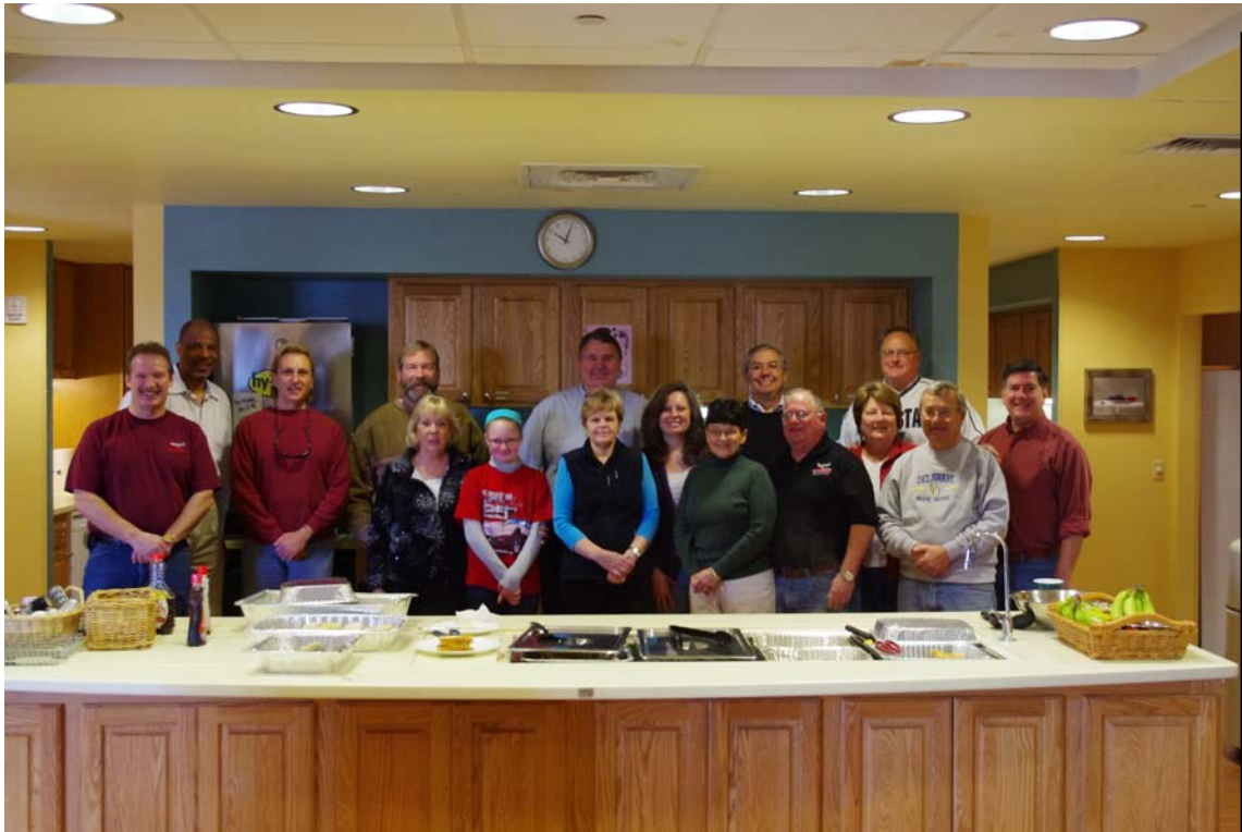
The Breakfast Club 2011

The official newsletter of the Corvette Club of Northern Delaware - February 2011