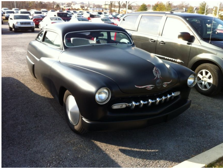
Merc "Lead Sled"