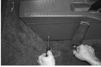
39: Now the side console trim can be put back into place.