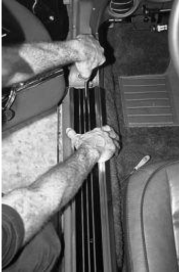
40: We also installed new sill plate to complete the package.