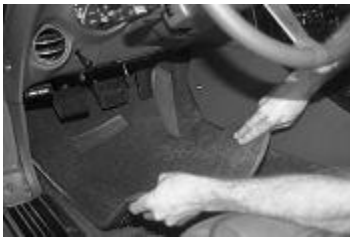
41: Here is the finishing touch. A new set of Corvette floor mats. What a perfect ending!