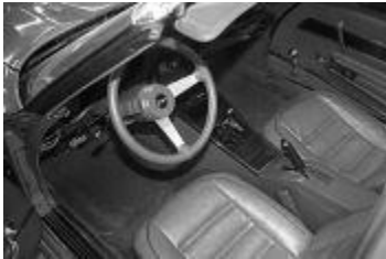
42: Here it is. A complete wall to wall Corvette carpet overhaul.

** This is a reprint of an article found on CCNDs Website....Many interesting articles can be found on the Clubs Website. Take a look** AR