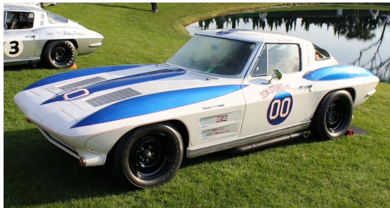
The first production Z06 Raced in California

Built by Pininfarina; commissioned by GM for the 1963 Paris Auto Show