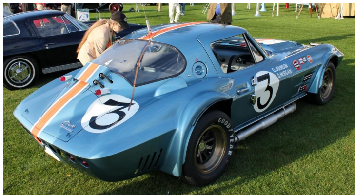
Grand Sport # 4