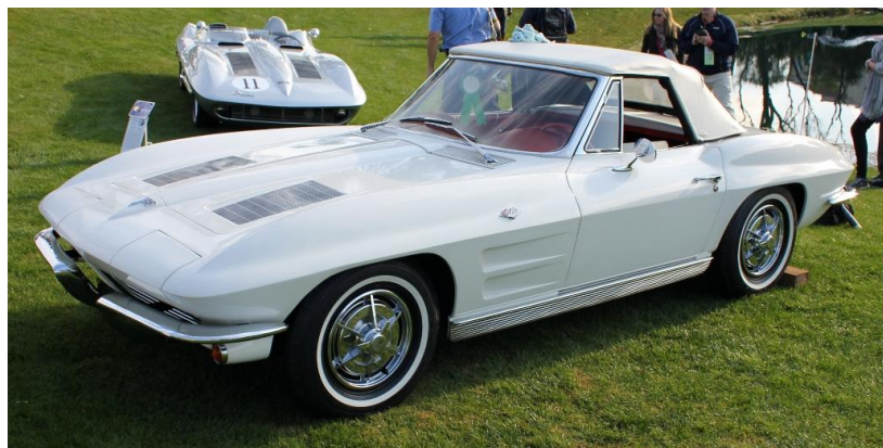
Totally Original Convertible