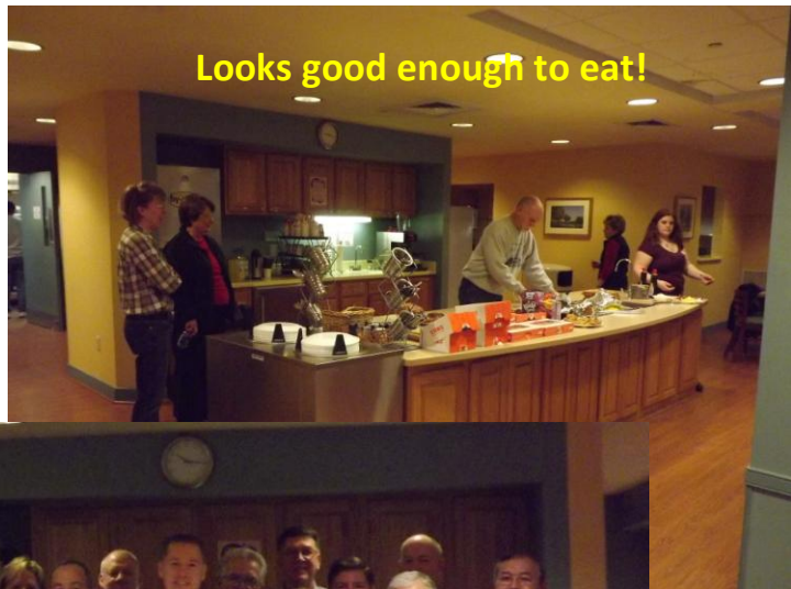
Looks good enough to eat!