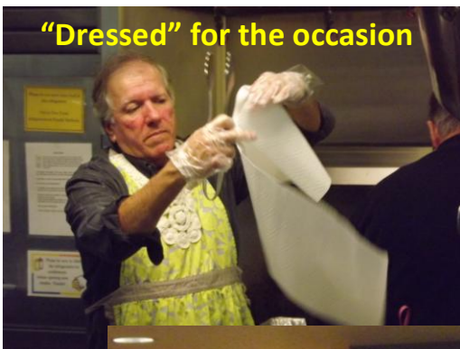
"Dressed" for the occasion