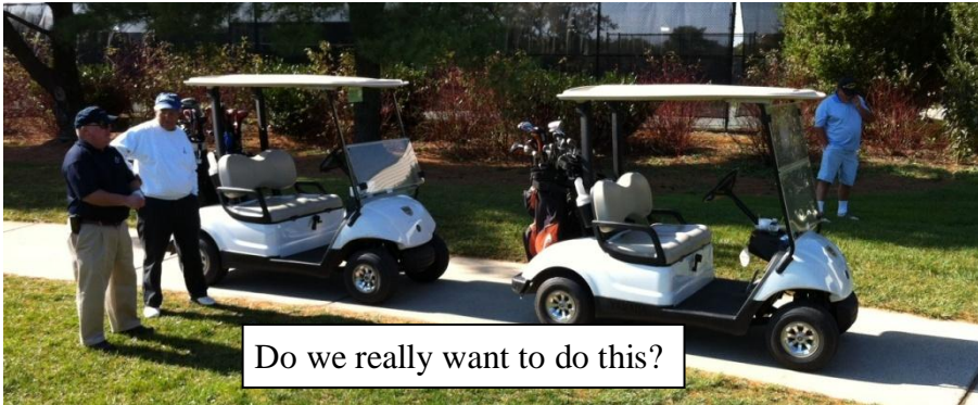
Do we really want to do this?