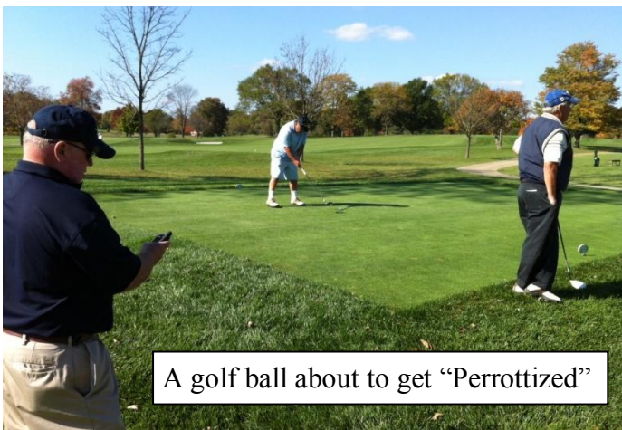
A golf ball about to get “Perrottized”