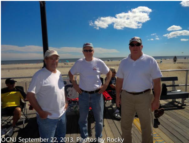
OCNJ September 22, 2013.