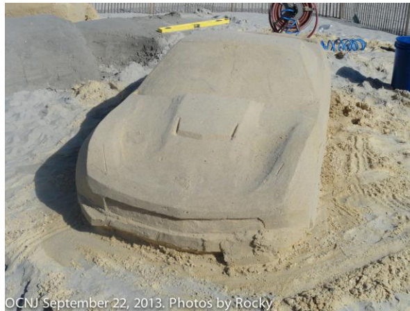
OCNJ September 22, 2013.

Did Rocky suspect anything when he took this shot??