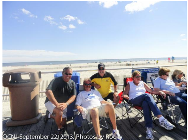
OCNJ September 22, 2013.