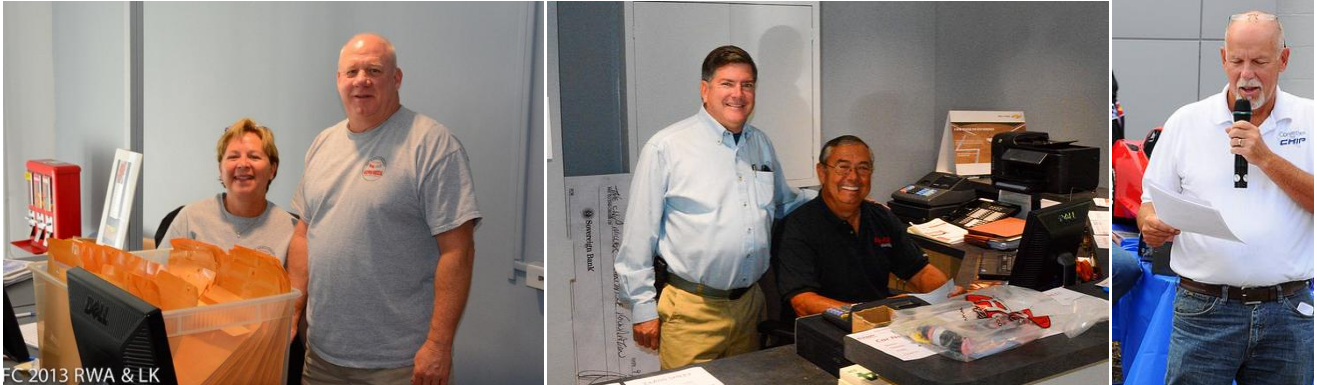
Pitching in – Organization, Registration, Voting, 50-50, Pictures and Awards: